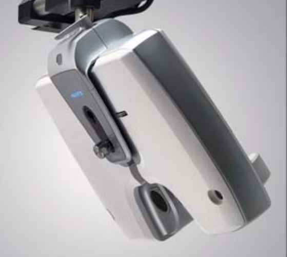
Tiltable Refractor Body