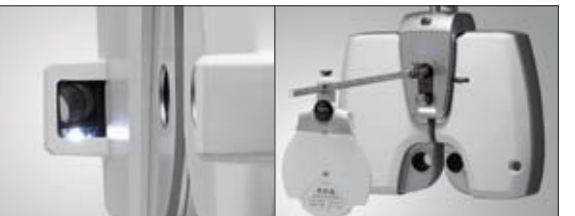
Illumination / Detachable Near Chart Rod